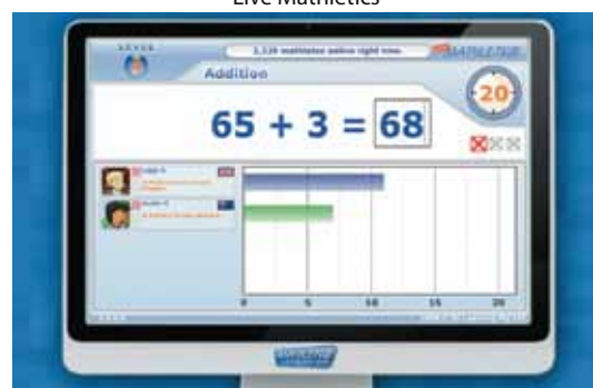
Mental arithmetic challenges in a global online community