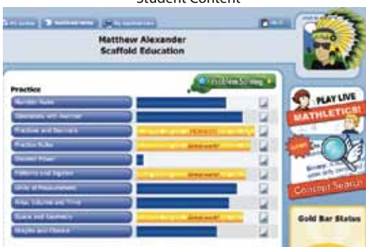
Curriculum specific content