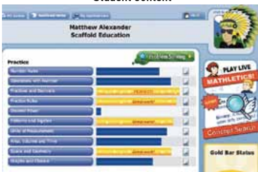
Curriculum specific content