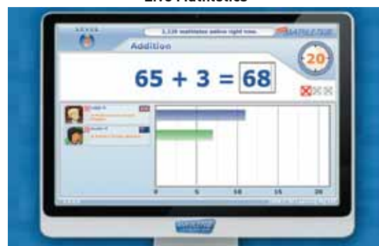
Mental arithmetic challenges in a global online community